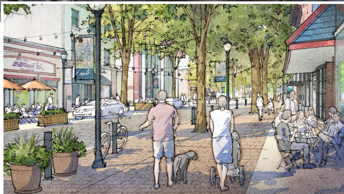
Downtown Dover Pathways/Loockerman Street – Dover, DE

Kittelison & Associates, Inc. is a transportation engineering and planning consulting firm that partners with public agencies and private organizations to solve complex problems through research, planning, operations, and design. transportation systems. Whether we're recommending improvements for a single intersection or helping communities plan for technologies of the future, we love tackling transportation challenges through planning, operations, design and research. We're a diverse, interconnected group of people working nationwide and operating as "one office in many locations."