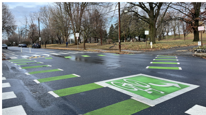
Lancaster Vision Zero Implementation – Lancaster, PA